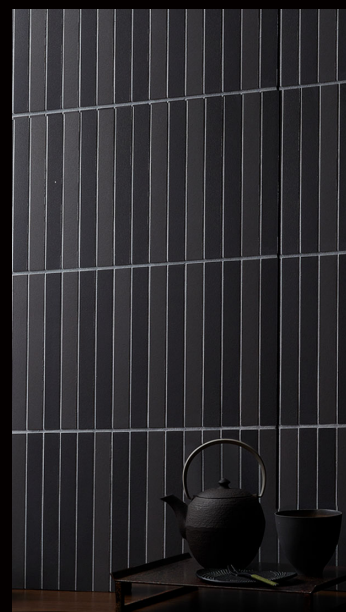
IM-2325P1/NGB-11 Black Mix